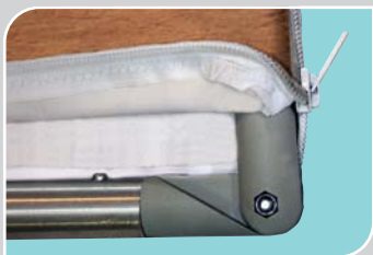
Snap button aluminum frame and pillowcase zipper graphic.

Wave is a portable, light-weight 10' fabric structure with endless graphic and promotional capabilities. The main unit can be easily assembled without any tools. The tubular aluminum frame assembles in minutes utilizing quick connection snap buttons and durable molded plastic corners. The high resolution dye sublimated fabric graphic slips over the aluminum frame and zips across the bottom to keep it secure.