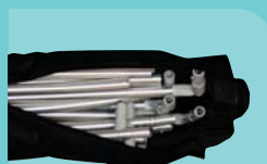
Tubular frame nylon case