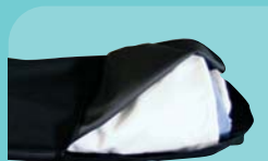
Fabric graphic nylon case